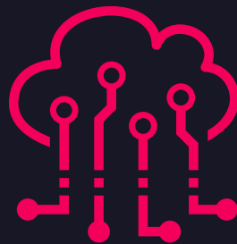
Internet of Things (IoT)